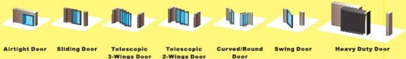
Airtight Door Sliding Door Telescopic 3-Wings Door Telescopic 2-Wings Door Curved/Round Door Swing Door Heavy Duty Door