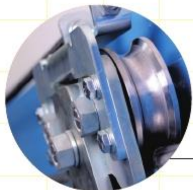
DURABLE HANGING TWIN WHEEL