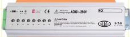
S-30 CONTROLLER WITH CTB DEVICE