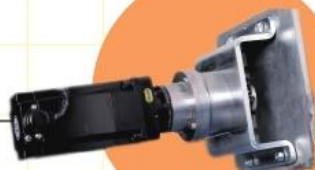
DC24V 250W BRUSHLESS DC MOTOR (PLANETARY GEAR)